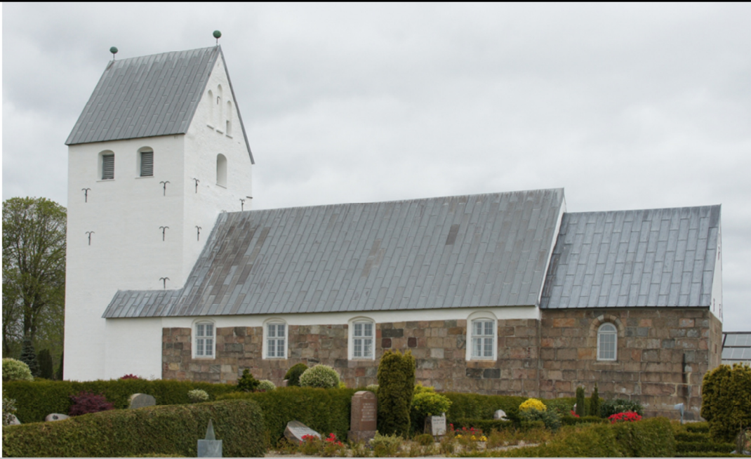
Øse Kirke, Ribe